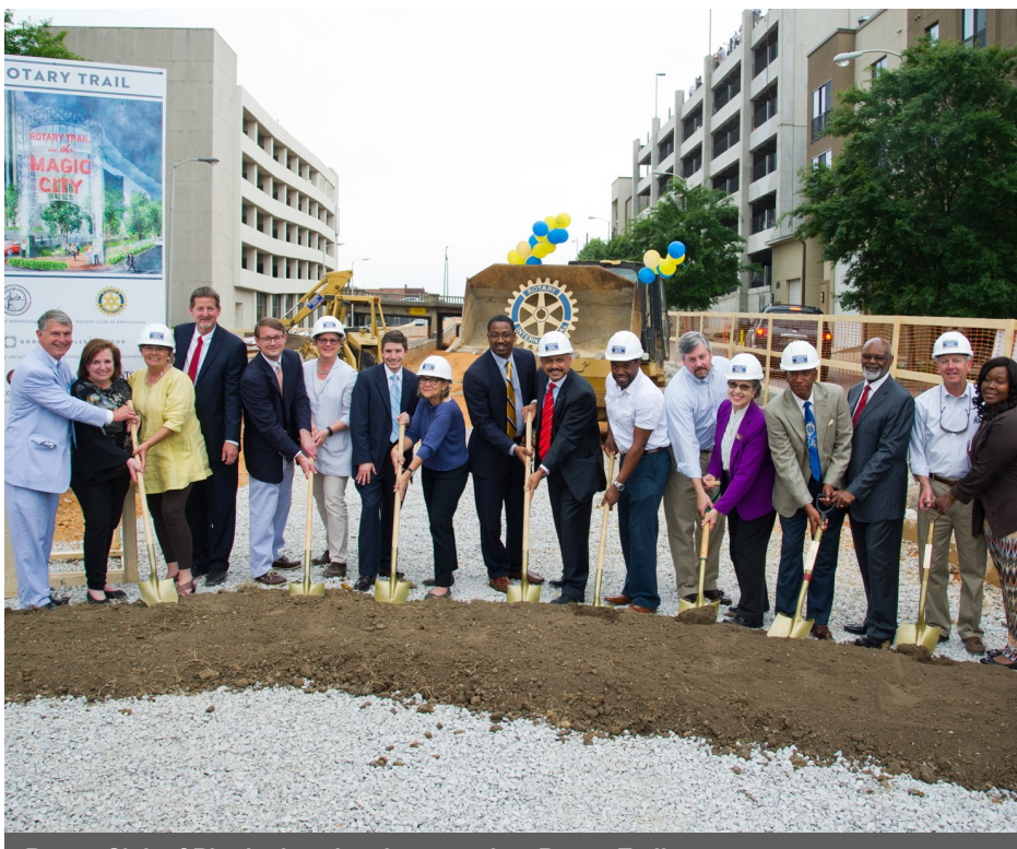
Rotary Club of Birmingham breaks ground on Rotary Trail